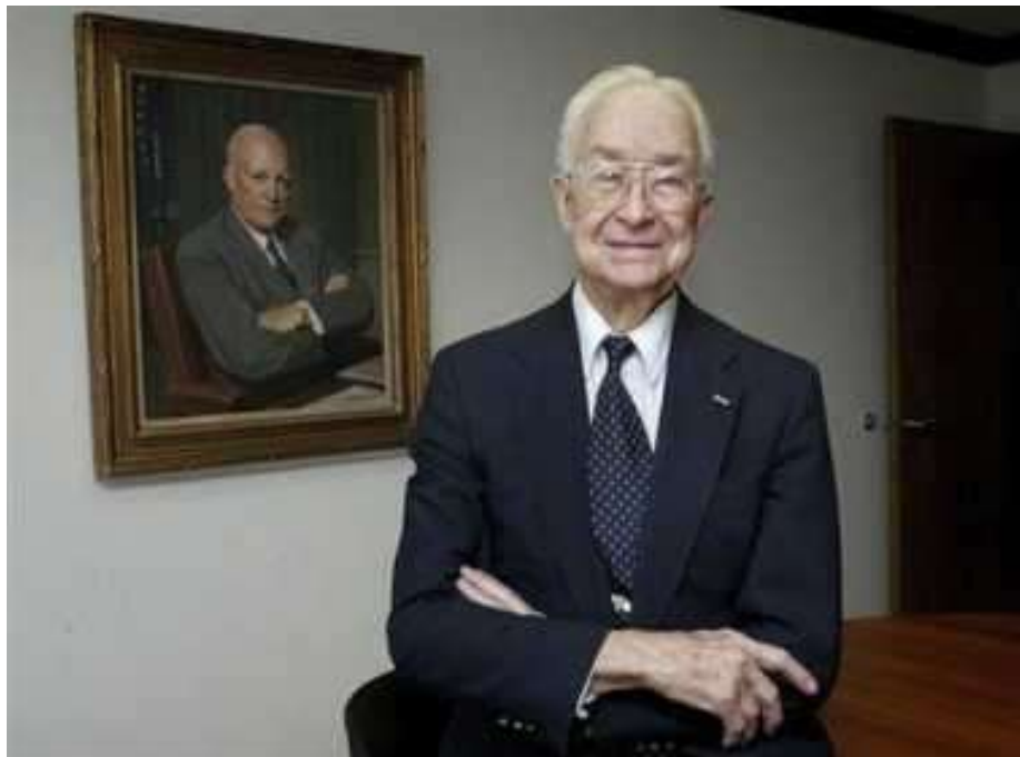
General Andrew Jackson Goodpaster